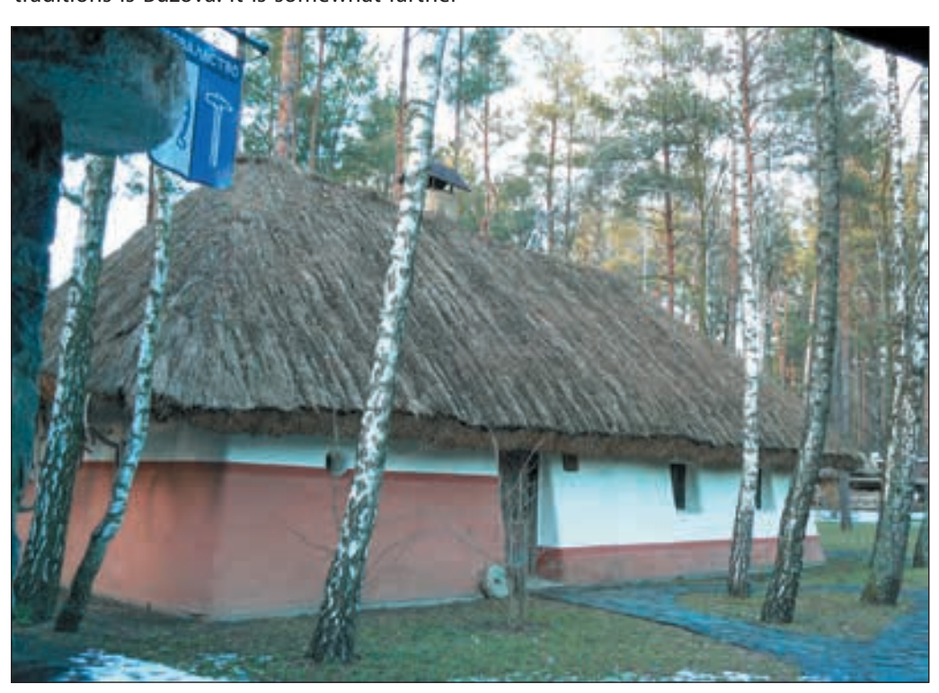
Khata with slanting walls and a thatched roof, depicted on the facility logo.

The ethnic restaurant and hotel houses are just a part of a large ethnographic facility called Ukrainian village that