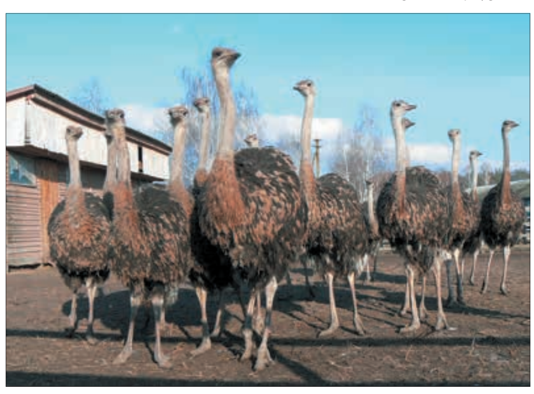
"Dolyna Strausiv" farm

Eight years ago the new masters of an ordinary poultry farm decided to turn it into an entertaining complex with a restaurant, a wine cellar, a tasting room, a playground