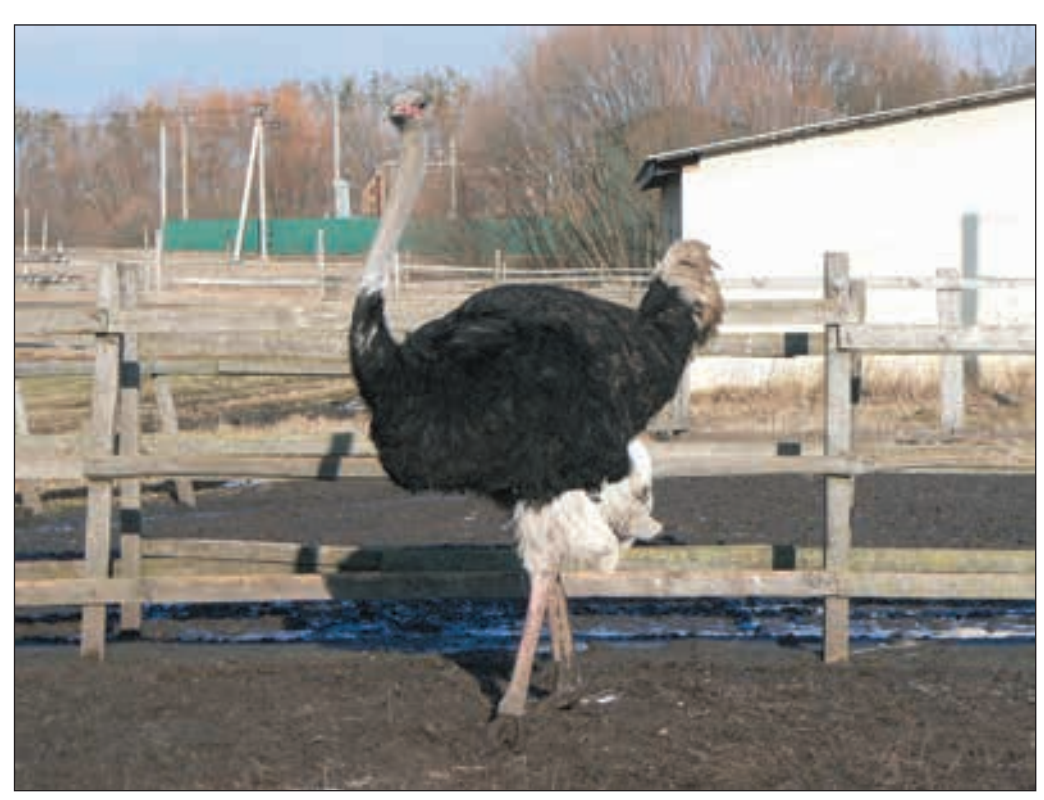
You can ride this ostrich

If the weather is good, there may be over a thousand guests here to celebrate the occasion. The thing is that people miss nature during the long winter period and it is worth going to the country for Masnytsia.