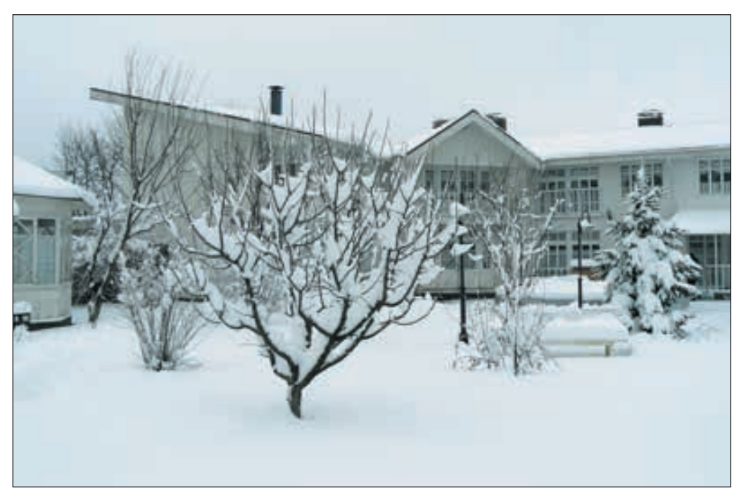
Restaurant "Babusyn sad"