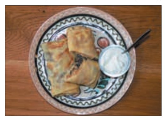
Pancakes with chicken

A folk band singing songs and dancing, as well as a special pancake menu comprising