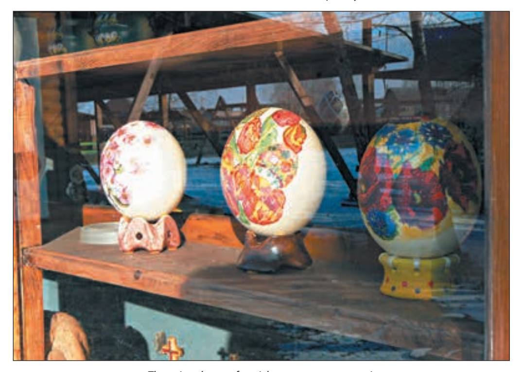
The painted eggs of ostriches are a great souvenir

The shell is not broken but used to make souvenirs — applying decoupage to paint and carve it. A souvenir egg price varies depending on the complexity of work.