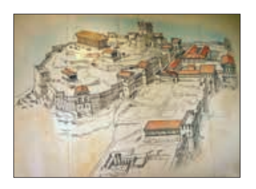
Reconstruction of ancient Panticapaeum Acropolis