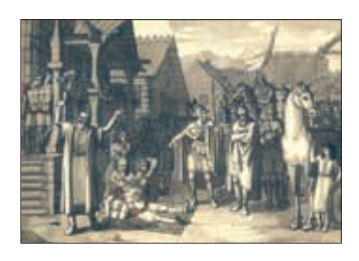
The Death of Oleg, Drevliane Prince, work by Taras Shevchenko

A significant role in the expansion of the Slavs across the European continent was played by external political factors too. At that time, due to the collapse of the Roman Empire and the advance southwards of the German tribes. in particular, Goths and Vandals, the integrity of the Slavic lands was infringed. That process promoted separation of the Slavs and the division of their tribes into groups eastern and western. As of the early sixth century, due to the fall of the Hun state, Slavs were able to settle in the south moving down to the banks of the Danube, and further to the north-western Black Sea region. which also entailed the division of the Slavic ethnos into different