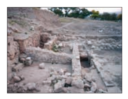
Excavations in Panticapaeum site on Mitridat mountain

like in ancient Troy. The main temple of Panticapaeum was devoted to this god. Other temples were built in honour of Aphrodite and Dionysus. In addition to temples, Panticapaeum was famous for its royal palace, a traditional square and an amphitheatre. A strong stone reinforcement system was built around the city. Nearby there was a necropolis, which consisted of a long series of burial hills, stretching along roads from the city to the steppe. From the southern side the city was surrounded with the biggest number of the burial hills, called Yuz-Oba, which is translated as 100 hills. Beneath these hills Scythian nobility representatives were buried. Once there was an Acropolis as well, with spacious streets and squares. One could enjoy the view of luxurious temples and palaces. Today only ruins can be seen there.