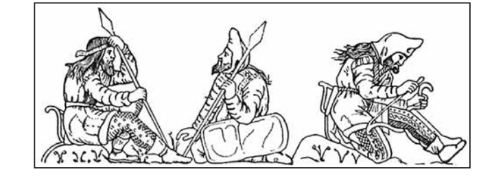
Scythian warriors on electrum vase from Kul-Oba

for two months only. Therefore, leaving his camp at night on the Oar River, the king rushed to leave Scythia with the best and able part of his army. The Scythians got a great deal of trophies and captives. At that time the detachment of king Scopasis approached the bridge guarded by the Greeks, and required their promise that the bridge would be drawn in due time. Nevertheless, it turned out later that the Greeks were reluctant to draw the bridge and destroyed only a part of it from the Scythian side. So, when Darius with his troops came up to the Danube, the bridge was quickly renewed. The Persian army successfully crossed to the right bank of the river and returned home. It is to be noticed that Darius's campaign failure in moving to the Northern Black Sea coast united the population of Scythia in their struggle against the external enemy. As to the Persian king himself, he learnt from that unsuccessful campaign and did not participate in any foreign campaigns any longer and, instead, sent his commanders to head the armies.