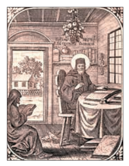
Nestor the Chronicler — a probable author of Chronicle "The Tale of Bygone Years"

Historical sources report that in the early sixth century, the Slavs were rather numerous. Our ancestors lived on the territory from the Adriatic Sea in the south to the Arctic Ocean in the north, from the deserts in Central Asia in the east to the Baltic Sea in the west. It is also known that at the time Slavic tribes inhabited Asia Minor, Italy and Spain. A famous Arab geographer of the tenth century Ibn Haukal noted that in Palermo on Sicily two out of five city quarters belonged to the Slavs.