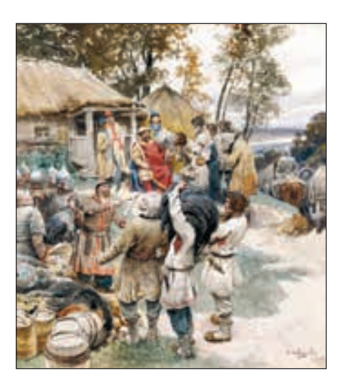
K. Lebedev. Prince Ihor collects duty from Drevlians in 945